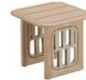
206461 Side Table Size: 500x500x450mm