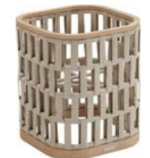
206492 Flower Basket Size: 530x530x620mm