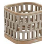
206491 Flower Basket Size: 530x530x440mm