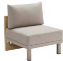
206408 Middle Sofa Size: 740x680x600mm