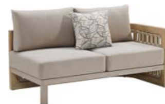
206429 Right Double Corner Sofa Size: 740x1410x600mm