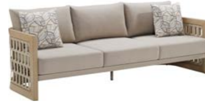
206441 Three-seater Sofa Size: 740x2140x600mm