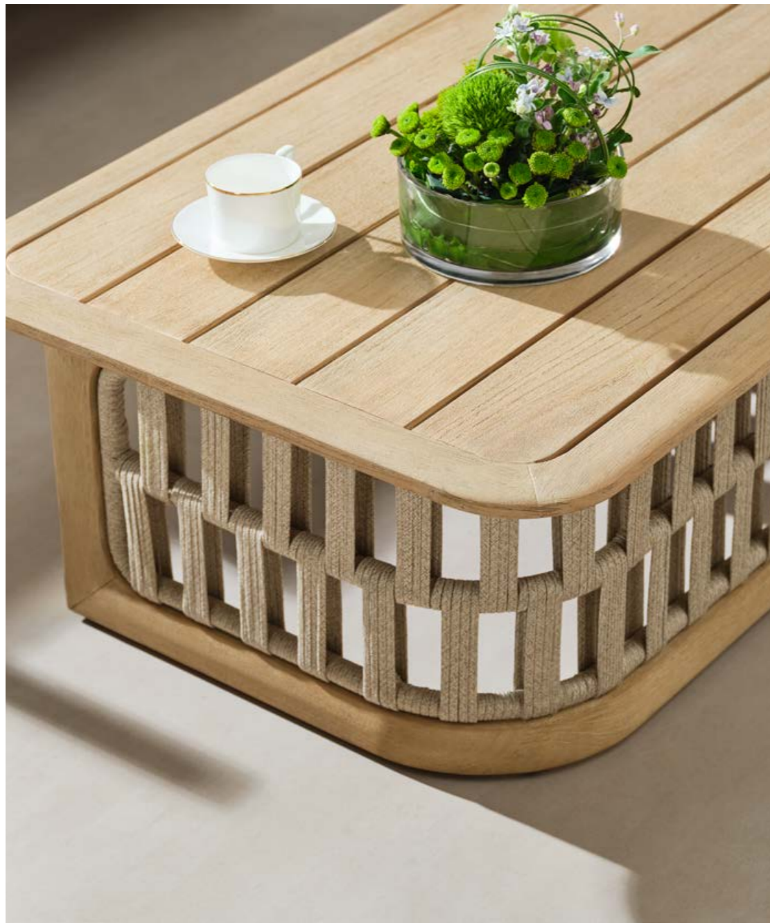
The texture of natural teak is delicate and warm.