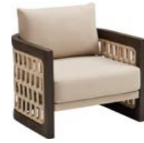
206411 Dining Chair Size: 615x610x670mm