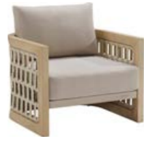
206421 Single Sofa Size: 740x780x600mm