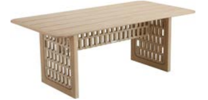
206471 Dining Table Size: 2000x1000x750mm