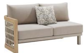
206427 Left Double Corner Sofa Size: 740x1410x600mm