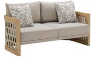
206431 Double Sofa Size: 740x1460x600mm