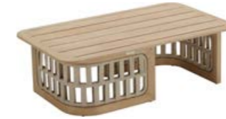
206481 Coffee Table Size: 1200x700x400mm