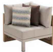
206428 Middle Corner Sofa Size: 740x740x600mm