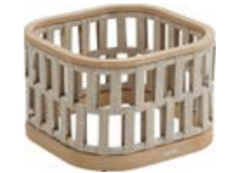
206493 Flower Basket Size: 530x530x360mm