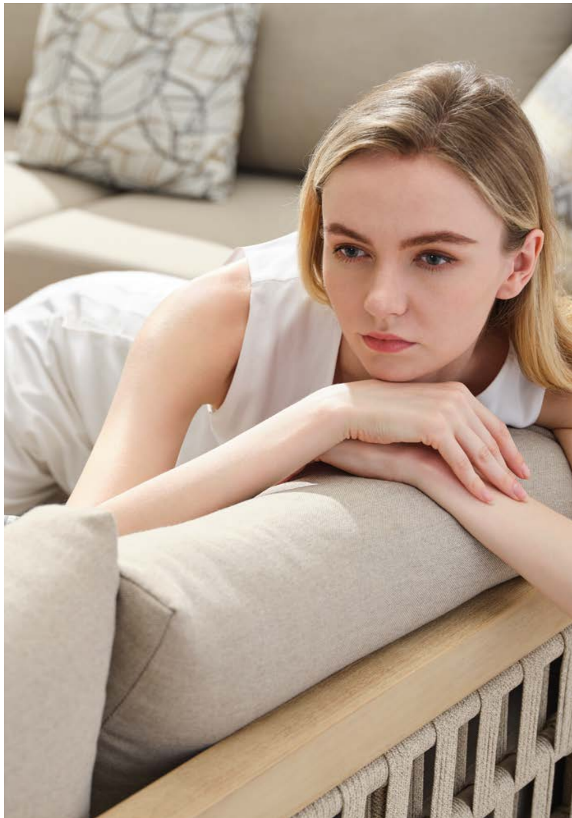
Super thick cushions with high density foams for an extra soft seating experience.